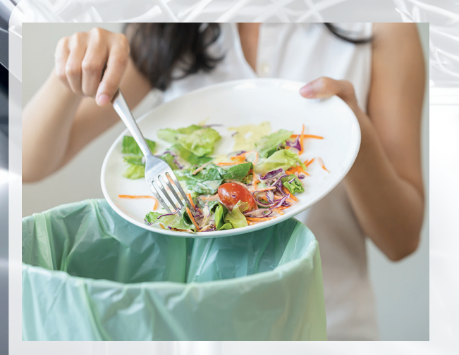
Remove waste food from all items. Soak any stubborn items prior in a hand wash solution.