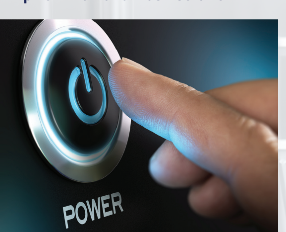
Once cycle finished, switch off the electric supply. Empty the machine. Remove any scrap trays.