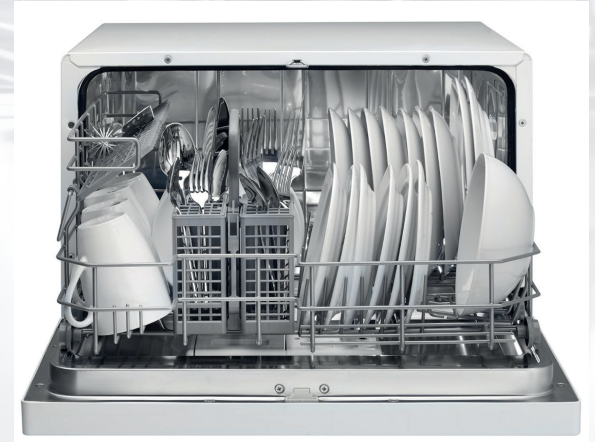
Stack the shelfs with items facing the same direction and by size. Stack cutlery in baskets.